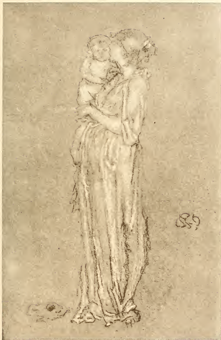
Blue and Violet. "IRIS." (Pastel.)